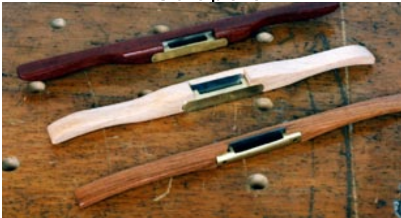
Flat Sole Gunmaker's Scraper - NEW!

The creation of this tool was inspired by an example of an old tool found in a gunsmith's shop. It is comprised of a narrow, long body featuring a brass sole, which houses a 1/16" thick, premium A2 blade, cut on a 25 degree bevel. This works marvels removing tool and saw blade marks. A very attractive and comfortable hardwood body rounds out this great addition to our line of scrapers.- $75